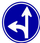
Proceed Only in Designated Directions