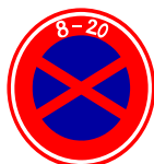
No Parking or stopping