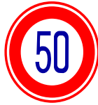
Maximum Speed Limit