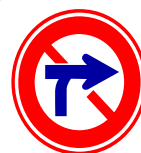
No Vehicle Crossing