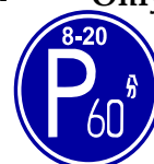
Time-limited Parking Zone