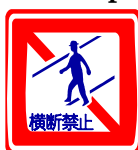
Crossing by Pedestrians Prohibited