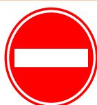
No Entry for Vehicles