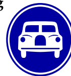
Motor Vehicles Only