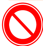
Closed to All Vehicles