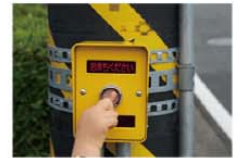
Push the button to cross the road.