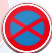
No Parking or Stopping